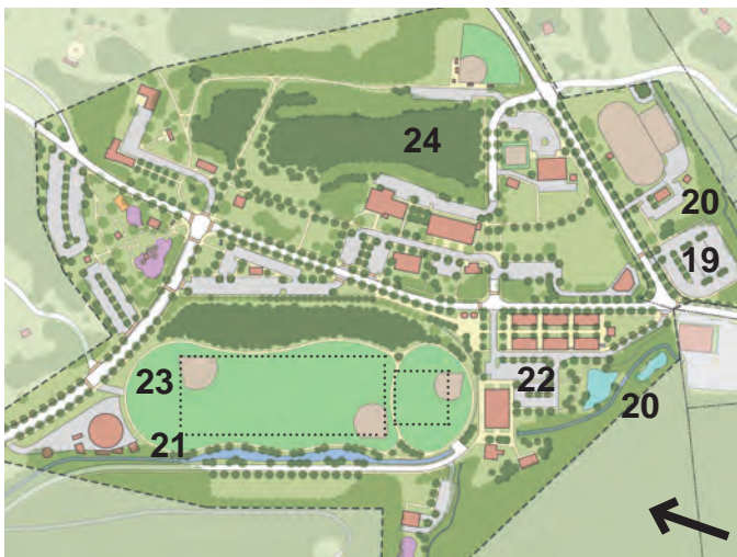
long-range plan with project initiatives highlighted

The budget figures above are an estimated opinion of probable construction costs and include construction, a 20% contingency, and design fees estimated at 10% of construction cost, including the contingency.